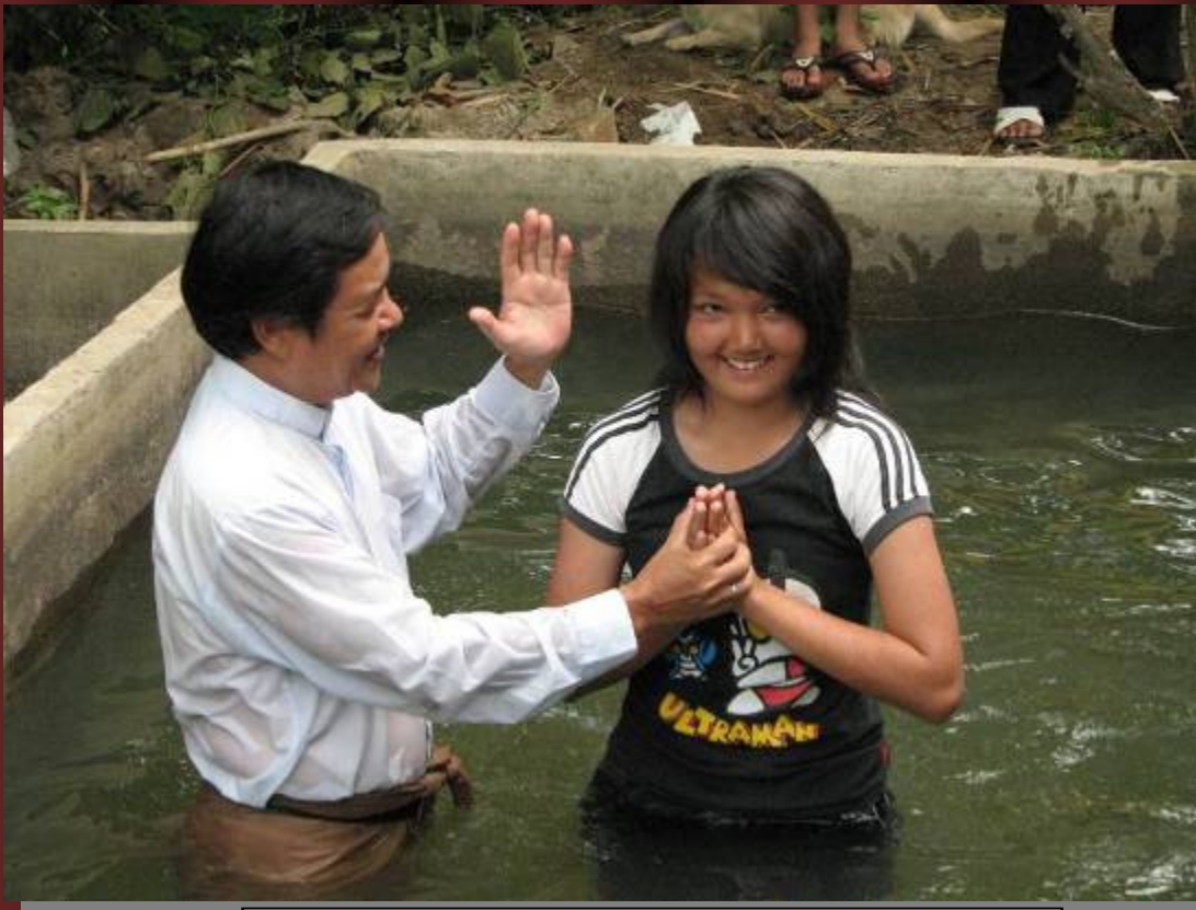
E Phat accepted the Lord and baptized on the same day

We are supporting the family financially for their daily food and living.