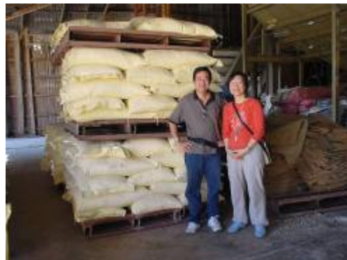
Orphans receiving towel ..... 2520 Kg of rice bought

About two hundred people were treated at medical and dental clinics from 10 AM to 5 PM. A young child had a nasty fall and got big lacerated wound on his right arm. People brought him to our clinic. We did cleaning and suturing of the wound under local anesthesia.