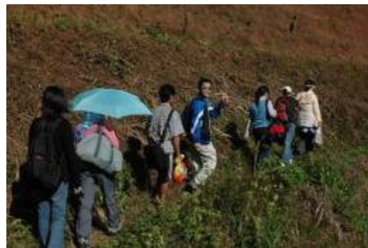
Refugee camp .....40 minutes walk up and down the mountain

No road for the car to drive into refugee camp. We had to walk up and down the hill for about 40 minutes. Once we got into the camp, a small pickup truck came to take us into the village. We started our medical and dental clinic immediately after we arrived there at 10 AM. Clinic was held in bamboo-school-building.