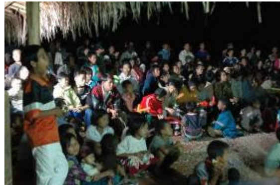
Refugees watching video on screen (Story on creation) The white bed sheet from our guest house was good enough to be used as screen