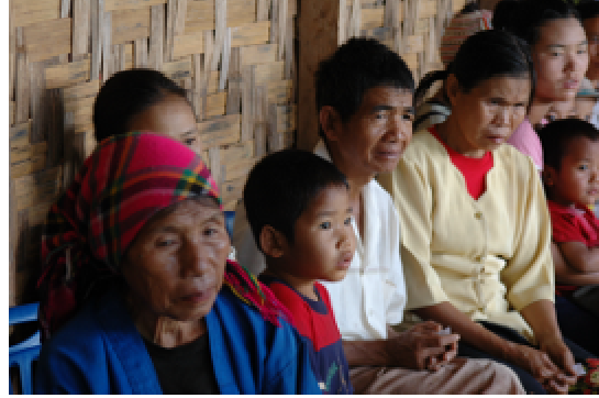
Children at dental clinic ..... Waiting to see doctors