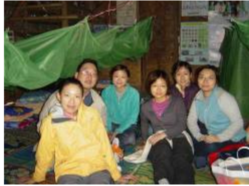
Our team at the camp

After evening program we were able to have a very quiet and peaceful night at 11 PM. Exhausted but rejoicing!